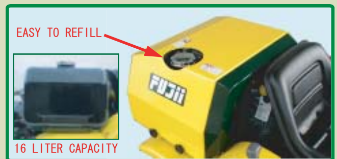
EASY TO REFILL

LARGE TURNING ANGLE MAKE IT EASY TO OPERATE AT ANY WORKING SITUATIONS AND CONDITIONS.