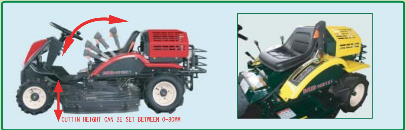
CUTTING HEIGHT CAN BE SET BETWEEN 0-80MM