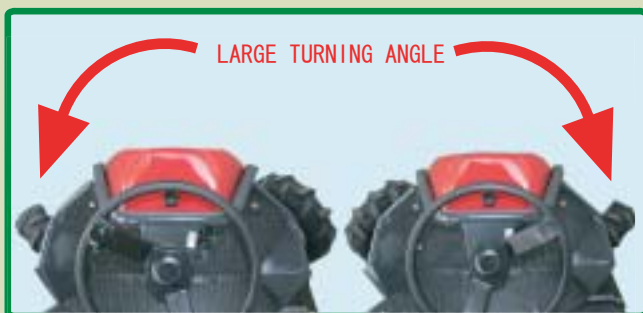
LARGE TURNING ANGLE

GAS SPRINGS ARE USED TO REDUCE THE FORCE REQUIRED TO OPERATE THE LEVER.